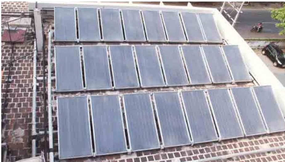
The corporation, civil station and GCDA will soon commission solar plants to cut energy bills

Ignoring the controversies surrounding solar energy, the three main civic bodies in the city, the Kochi Corporation, the civil station and the Greater Cochin Development Authority (GCDA) will soon commission solar plants to save their energy bills.